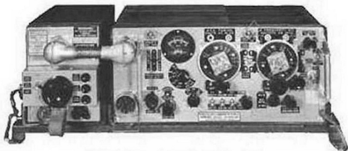
WS No. 19 Mark III

This file has been down loaded from The Wireless-Set-No19 WEB site.