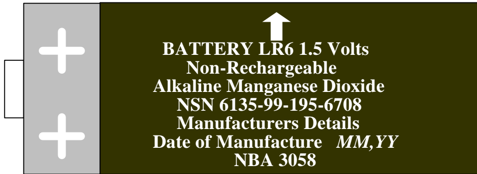
Fig 2 Battery Marking

Product shall be marked in accordance with figure 2.